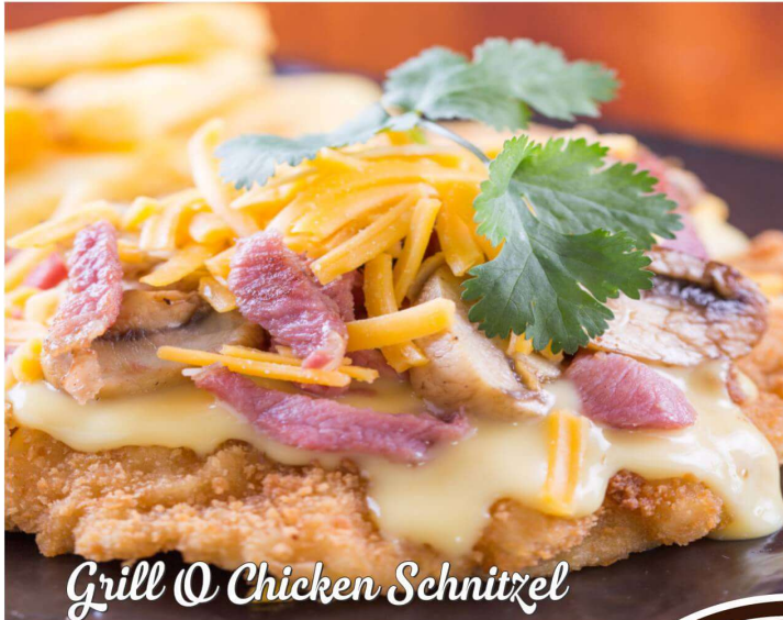
Grill O Chicken Schnitzel