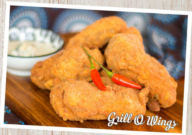
Grill O Wings