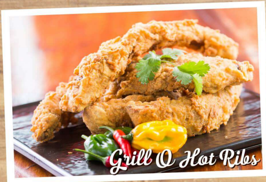
Grill O Hot Ribs