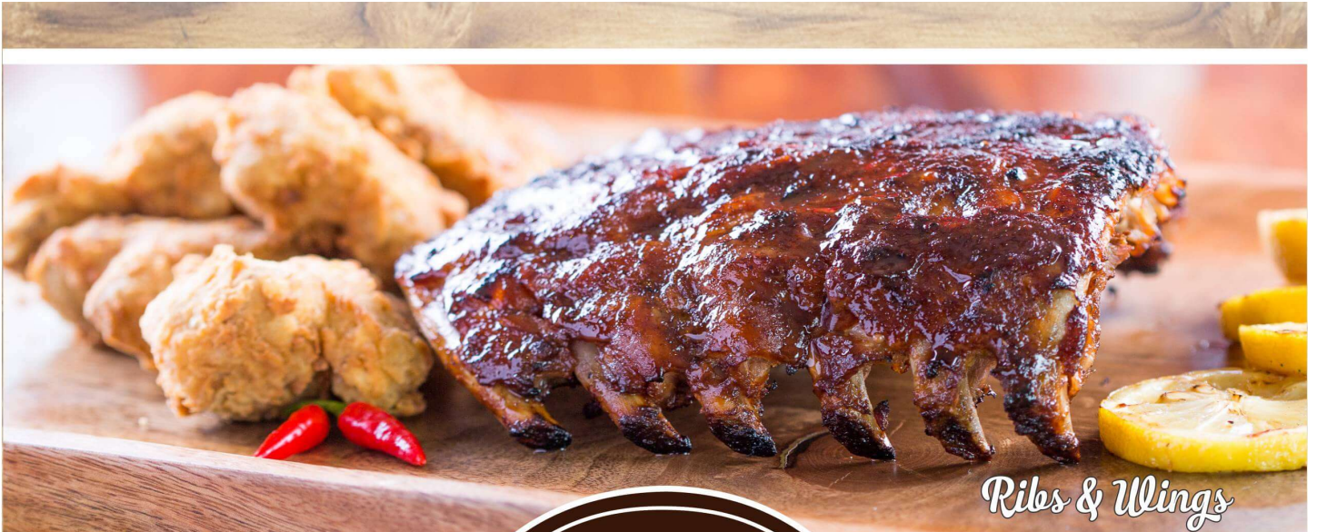
Ribs & Wings