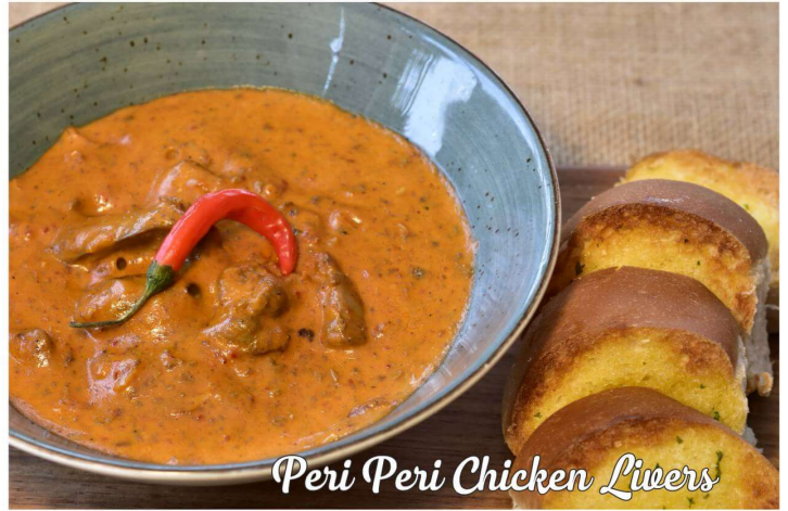
Peri Peri Chicken Livers