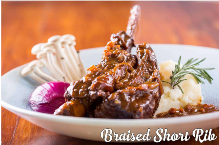
Braised Short Rib