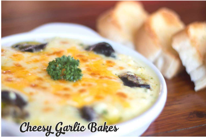
Cheesy Garlic Bakes