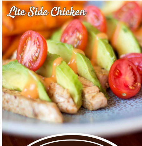
Lite Side Chicken