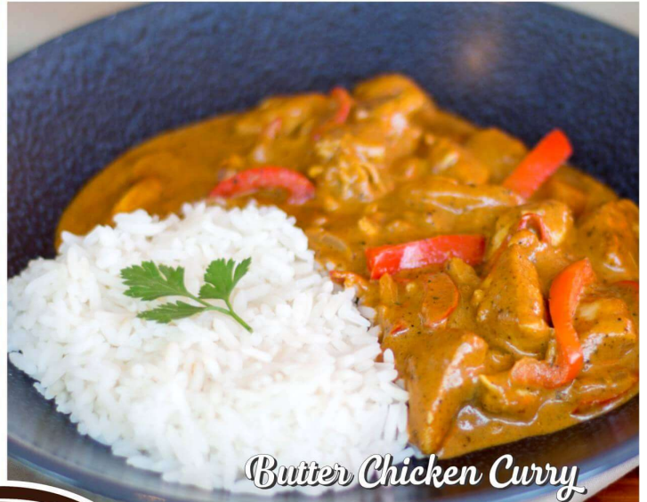
Butter Chicken Curry